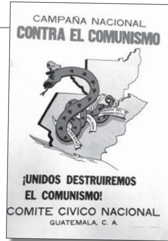
Political flier.

Two moments in Guatemalan politics anchor my study of the clash between incompatible approaches to foreign relations: the overthrow of President Miguel Ydigoras in 1963 and the 1966 election and presidency of Julio Cesar Mendez Montenegro. Communist Cuba defied U.S. hegemony in the Western Hemisphere and Kennedy sought to counter revolution with reform under the direction of the Alliance for Progress. The humiliating failure of the Bay of Pigs invasion (1961) and the nearly apocalyptic Cuban Missile Crisis (1962) hardened the Kennedy administration attitude toward Latin American leftists. When Juan Jose Arevalo, a former president of Guatemala with a record of left-leaning reform, announced he would run for re-election, Kennedy and his team feared that he would take Guatemala down the same path as Cuba. The Kennedy administration decided on preventative action in March 1963, when it undermined Alliance for Progress principles by allowing the Guatemalan military to overthrow the constitutional government of President Miguel Ydigoras in order to cancel the upcoming elections. Arevalo, a supporter of the Alliance for Progress, was forced to flee Guatemala. Moreover, during Kennedy's tenure in office, the United