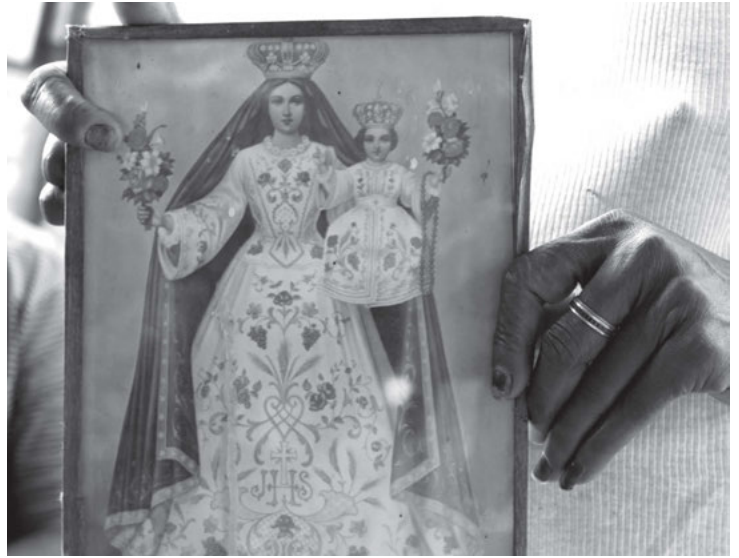
Above: La Virgen de los Remedios. • Below left: A nopal plant in San Cristobal, Dominican Republic